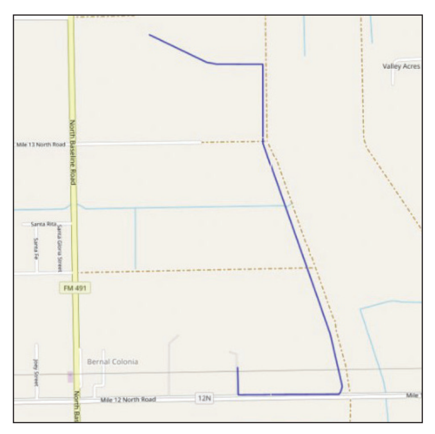
The Schuster Pipeline System is a Gathering Pipeline that is 2" in diameter in Hidalgo County.