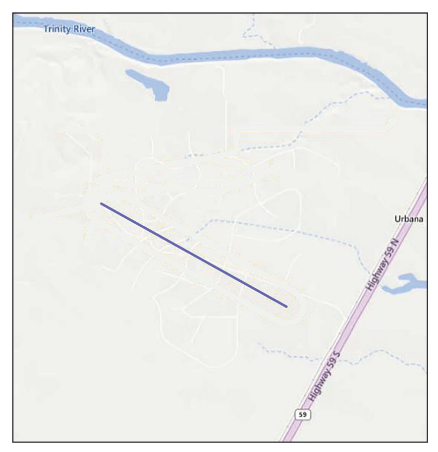
The San Jacinto Gathering system is a 4.5" Gathering Pipeline.